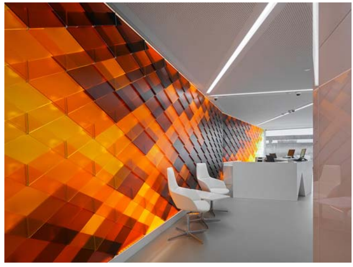
Interior of INSIDE-OUT, the design concept for the new Schaffhausen Raiffeisen Bank branch by NAU Architecture and Drexler Guinand Jauslin Architekten.

The new Raiffeisen Bank branch designed by NAU Architecture and Drexler Guinand Jauslin Architekten was completed this past May in the historical city center of Schaffhausen, Switzerland, after the design won first place in a competition back in May 2012. The design as a whole appeals to the senses, going beyond the basic functions of a bank to creating an open, welcoming place for customers through light, color, and efficient use of space. — bustler.net